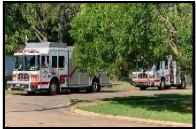
3 Fire Trucks