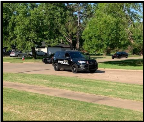
10 Police Cars